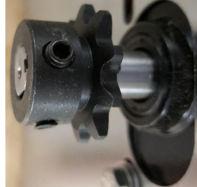
Single Conveyor: Setscrew on Key and Flat

The Conveyor Belt will have a single Drive Sprocket. The Sprocket is seated on a Conveyor Shaft, which much like the Drive Motor shaft, has a Flat area.