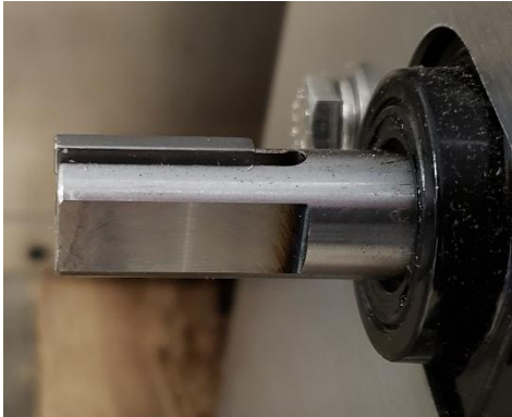
The Motor Sprocket is flush with the Shaft of a Conveyor Motor.