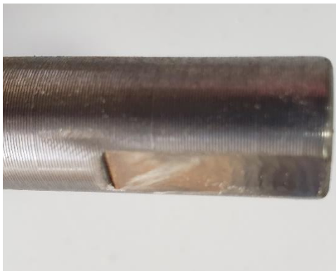
Drive Sprocket is flush with the Shaft of a Standard Conveyor Shaft.